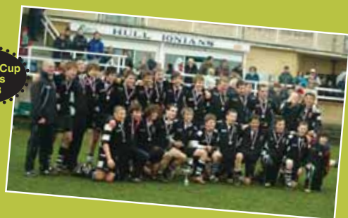
U14's Yorkshire Cup Winners 2007-8

Upholding a longstanding tradition the U13's sent two teams to the prestigious Benevento Rugby Tournament in Naples, one of which was knocked out in the semi-final because of the quirky rule that in the event of a draw the team with the lowest average age goes through!