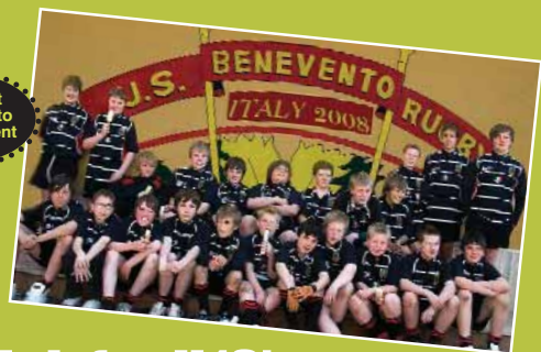
U13's at Benevento Tournament