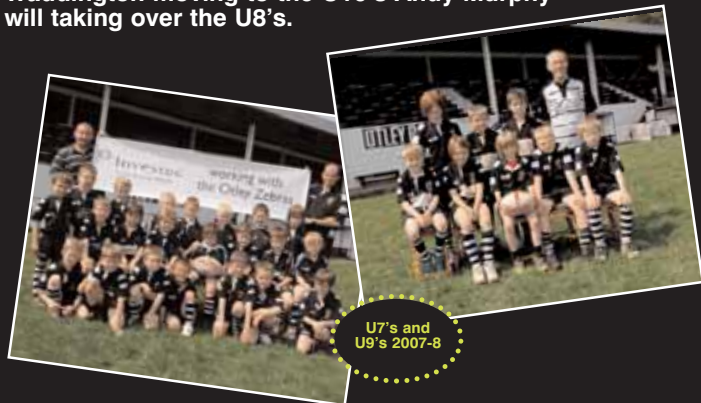
U7's and U9's 2007-8