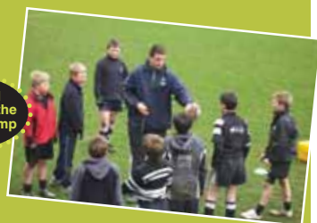
Fun and games at the Easter Camp

U14's and U15's were both on tour in Dublin this year, enjoying some traditional Irish hospitality. The U14's played Blackrock College going down to their only defeat in the last three years, whilst the U15's performed well in a Gullivers festival against Irish and touring sides.